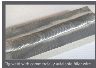
Tig weld with commercially available filler wire.