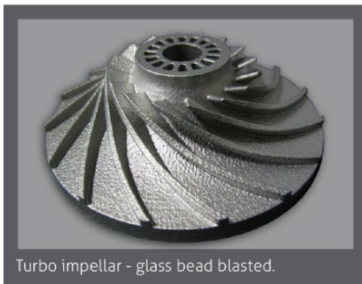
Turbo impellar - glass bead blasted.

Elementum 3D's A2024-RAM10 Aluminum Metal-Matrix Composites (MMC) combine the ductility and toughness of metals with the strength, hardness, stiffness, and wear resistance of ceramic reinforcing phases. Aluminum MMCs are of particular interest to aerospace, automotive, and military applications that require high specific strength, extreme wear resistance, thermal conductivity, and good retention of strength at temperature.