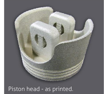
Piston head - as printed.

Elementum 3D's 2024 Aluminum Metal-Matrix Composite (MMC) with two percent ceramic provides excellent strength, good ductility along with the wear resistance of ceramic reinforcing phases. A2024-RAM2 is suitable for many applications and is an outstanding additive material solution for structural components. It is heat treatable like wrought 2024 aluminum.